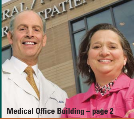
Medical Office Building – page 2