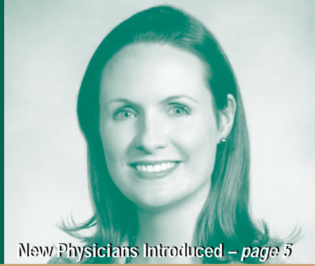
New Physicians Introduced – page 5